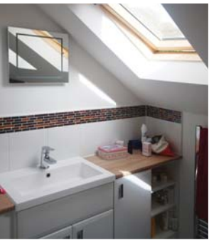
No. 11 Swan Close Thrapston